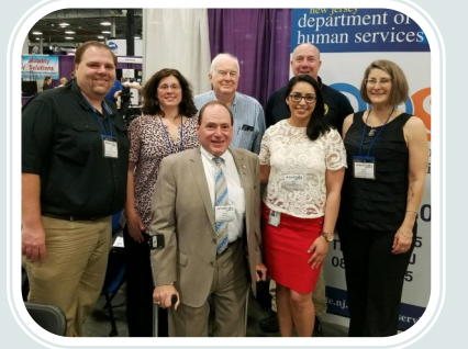
Division of Disability Services at the Abilities Expo