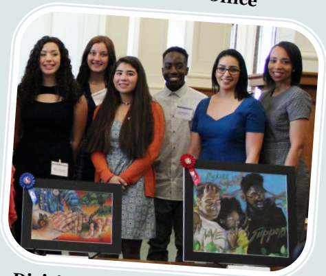
Division of Family Development's Teen Media Contest