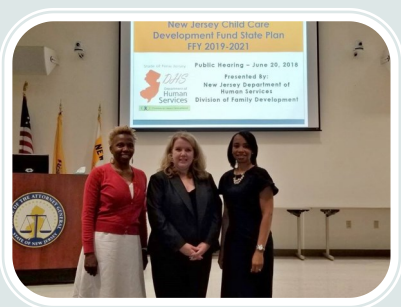
Division of Family Development Child Care Hearing