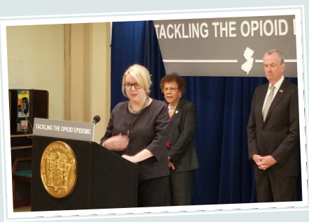
Announcement of funding to fight opioid epidemic in NJ