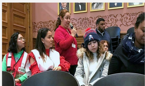
Puerto Rican Evacuee Session in Jersey City in March

In 2017, Hurricane Maria devastated Puerto Rico and destroyed the island's power grid. Many evacuees relocated to New Jersey in the aftermath of the storm.