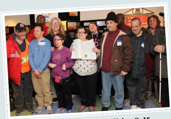
Developmental Disabilities Self- Advocates at the Capitol