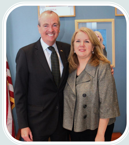
Commissioner Johnson with Governor Murphy