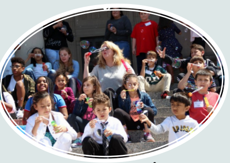
Bubbles 4 Autism