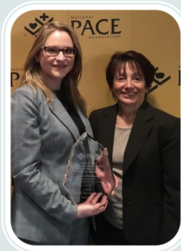
Division of Aging Services Wins PACE Award