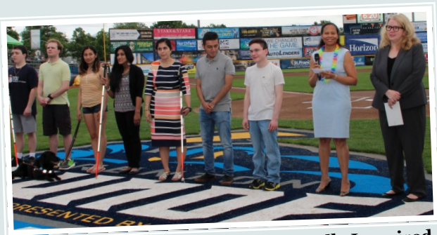
Commission for the Blind and Visually Impaired Awareness Night at the Trenton Thunder