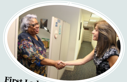
First Lady Tammy Murphy visits DHS Central Office