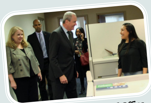
Governor Visits DHS Central Office